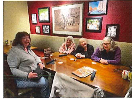
Ladies who lunch